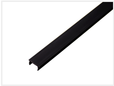
Black, 2 meter