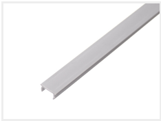
Gray, 2 meter