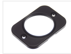
Front panel, 1 unit