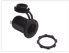
Unit, Cigar plug