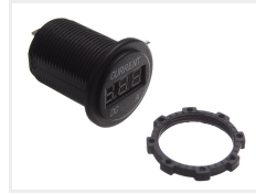
Unit, Ampere meter O-IO Amp