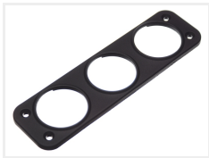
Front panel, 3 units