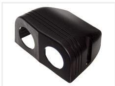
Enclosure, 2 units