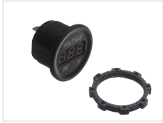
Unit, Voltage meter