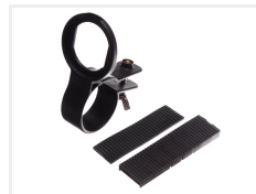
Bracket, Handle / tube