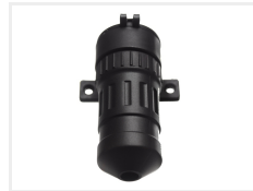
Bracket, Closed housing