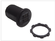
Unit, Voltage and amperemeter