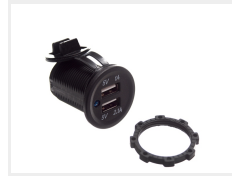
Unit, 2 x USB