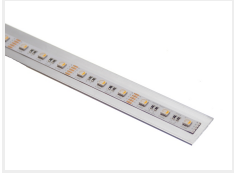
30mm x 2mm, 199cm