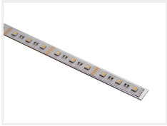
10mm x 2mm, 199cm