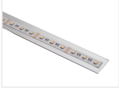
30mm x 2mm, 299cm