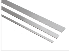
100mm x 2mm, 199cm