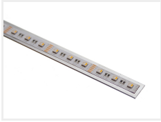
20mm x 2mm, 199cm