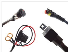
12V, 1 x 2-pin Superseal I.5 plug