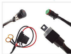
12V, 1 x 2-pin Deutsch DT plug