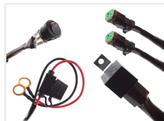
12V, 2 x 2-pin Deutsch DT plug