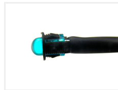
Blue, 5 mm