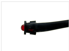
Red, 3 mm