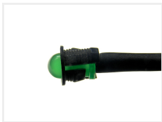
Green, 5 mm