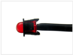
Red, 5 mm