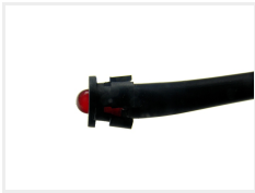
Red, 3 mm