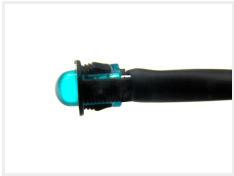
Blue, 5 mm