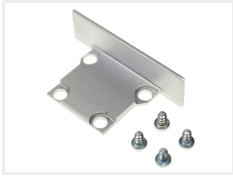
Accessories, 1 end cap