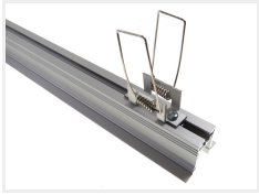
Accessories, 1 mounting-spring