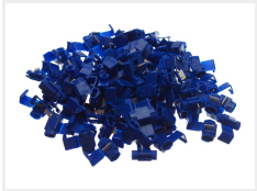
Blue - 100 stk.