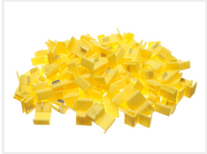
Yellow - 100 pcs.