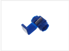
Blue - Singly