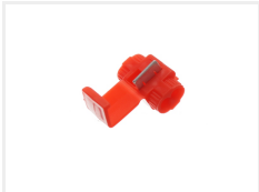
Red - Singly