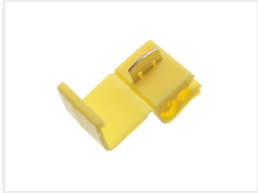
Yellow - Singly