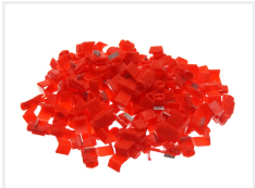
Red - 100 pcs.