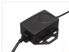
24V Canbus Kit, H7