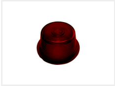
Glass, Smoked red