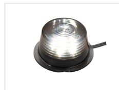
LED unit, Smoked warm white