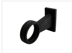
Rubber base, Straight