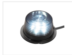
LED unit, Smoked cold White