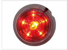
LED unit, Red