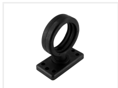
Rubber base, Short