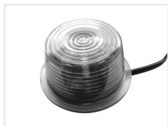
LED unit, Warm White