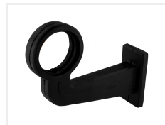
Rubber base, Long