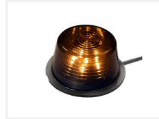
LED unit, Smoked orange