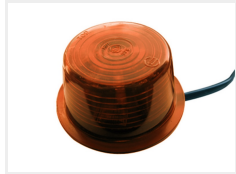
LED unit, Orange