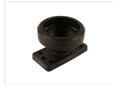
Rubber base, Y-model