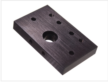
Plate that can be bolted on to the end of a C-beam profile. Can be used for mounting a motor and a lead screw.