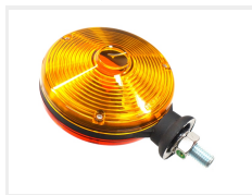
BA15, Red / Orange glass