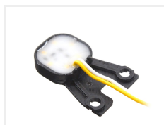
24V LED emitter, Dual Color Red / Xenon white