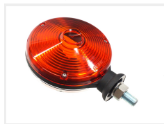
BA15, Red / Clear glass