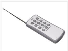
Remote, 12 buttons