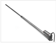
12V DC, 500mm