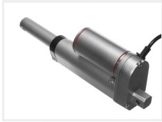
12V DC, 50mm