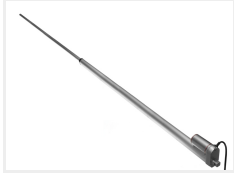
12V DC, 1000mm