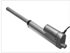
12V DC, 150mm