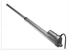
24V DC, 300mm