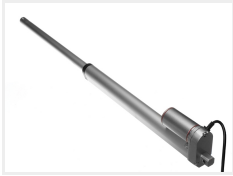
12V DC, 300mm