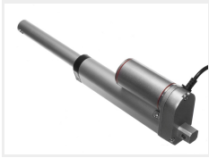
12V DC, 100mm