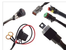
24V, 1 x 2-pin ATP plug