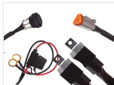
12V, 1 x 3-pin Deutsch DT stik