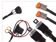
12V, 2 x 3-pin Deutsch DT stik