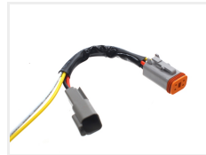
Accessori, Adapter cable - 4-pin to 2-pin