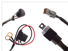
12V, 1 x 2-pin ATP plug