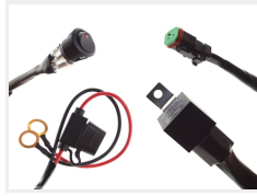
12V, 1 x 2-pin Deutsch DT plug