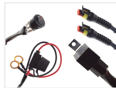
12V, 2 x 2-pin Superseal I.5 plug