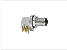
3 pins, Han