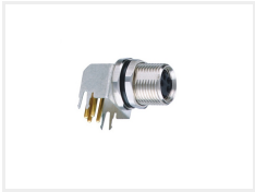
3 pins, Female