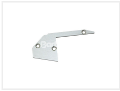
Accessories, 2 end caps