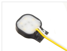
24V LED emitter, Golden yellow