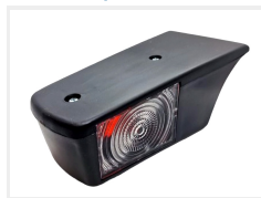
Lamp with BA15s, Red / Clear