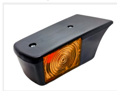
Lamp with BA15s, Rød / Orange