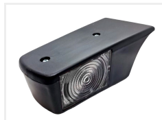
Lamp with BA15s, Clear / Clear