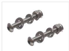
Stainless mounting set, M3 30mm